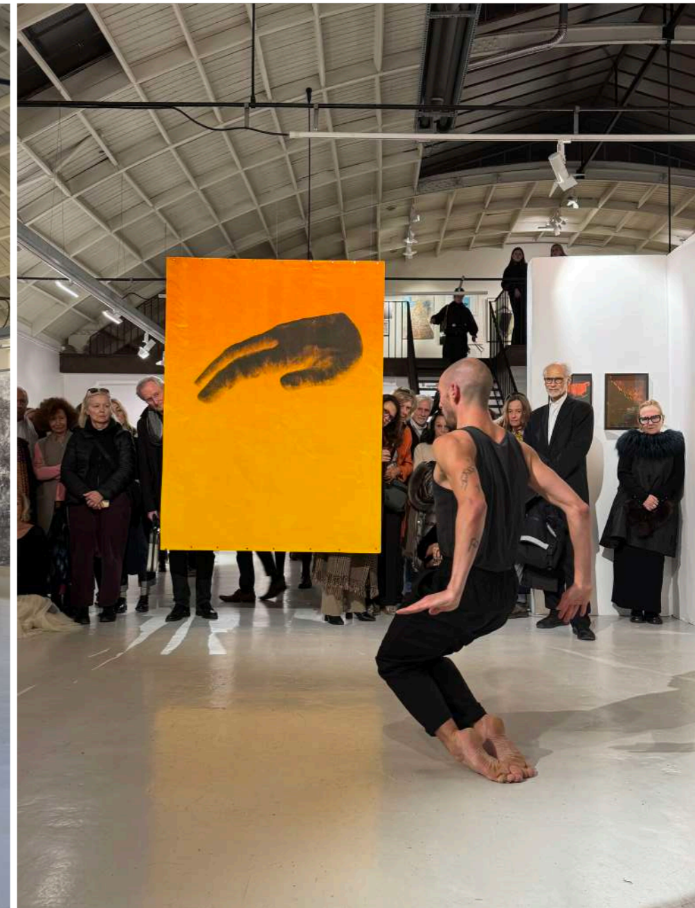
Espace Communes , Visible. Invisible. (collective exhibit and performance), Paris, France, 2024